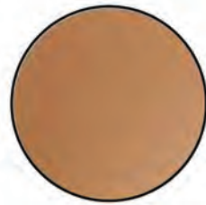
611 (US9) Bright Bronze