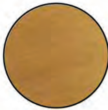
606 (US04) Satin Brass