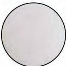
625 (US26) Bright Chrome