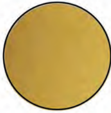
605 (US03) Bright Brass