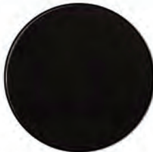
(US19) Flat Black