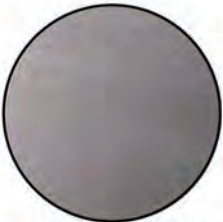
618 (US14) Bright Nickel