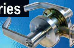
Standard-Duty Cylindrical Grade 2 Leversets