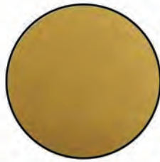
5E PVD Anti-tarnish