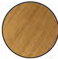
609 (US5) Antique Brass