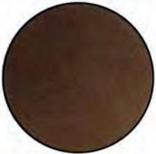
(US20A) Dark Bronze/Clear Coat