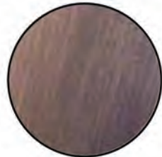
620 (US15A) Antique Nickel