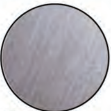
626 (US26D) Satin Chrome

NOTE: Product appearance may differ from this chart as a result of the differences in plated versus printed materials.