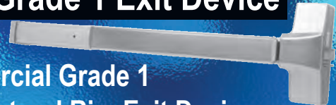
Commercial Grade 1 Architectural Rim Exit Device