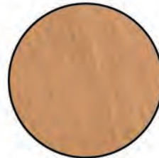
612 (US10) Satin Bronze