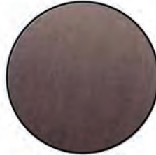
619 (US15) Satin Nickel