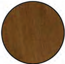
613 (US10B) Dark Bronze Oil Rubbed